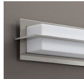
-20 Polished Nickel